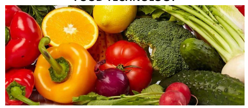
What is food technology?

Food technology is the study of how different foods can be used and made intofood products.